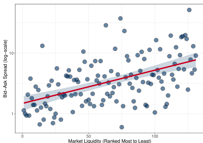
Figure 1. Markets are ranked by their liquidity (most liquid to least liquid) and to examine the bid-ask spread. The spread serves as a useful proxy for transaction costs and increases as liquidity decreases. Note the log scale on the y -axis, so the spread for the least liquid asset is 10x that of the most liquid.

The difference between what a buyer will pay and what the seller will receive for a particular asset at a given point in time is referred to as the bid-ask spread . The bid-ask spread is often used as a proxy for transaction costs (Demsetz, 1968; Glosten and Harris, 1988) since it is relatively easily quantified and is an accurate reflection of the instantaneous cost of executing a trade. In Figure 1, we compare the bid-ask spread vs. liquidity for 120 futures markets (ranked from highest liquidity to lowest liquidity). We see that in general, as liquidity decreases, the bid-ask spread increases, which has been demonstrated previously (e.g., Tinic and West (1972); Jones (2002)). One explanation which might explain such a relationship is that as more trading takes place, tighter bid-ask spreads are needed for market making to be profitable.